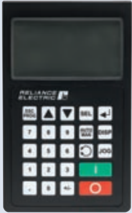
FULL NUMERIC OIM/KEYPAD

Optional features include an assortment of communications modules, software utilities, remote keypads and full-numeric keypads.