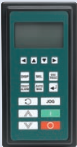
REMOTE NEMA 4 OIM/KEYPAD