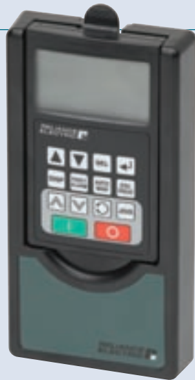
REMOTE NEMA 1 OIM BEZEL KIT